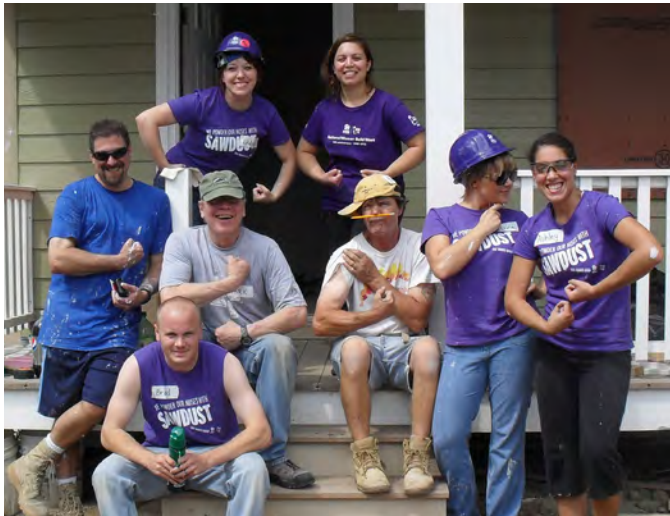
(Top L) Brighton High School students volunteering on Martin Luther King Jr. Day - Brighton High School along with McQuaid High School will be building a house in 2014. (Top R) Erie Insurance Employees took turns in the excavator at the ground breaking of their sponsored home on Jay Street. (Bottom) LaBella Associate's volunteer working on the 2012 Women Build house.